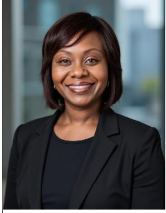
2025 MCMS President