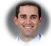
William McCunniff, MD.

Earlier this month Influenza A was prevalent at greater levels than we have had in the last 15 years according to the CDC; however, Texas physicians are now being faced with increasing levels of measles (rubeola) in our state at higher levels than any other in the last 30 years. According to the Texas Department of State Health Services, there is a measles outbreak in the South Plains region of Texas with 124 cases confirmed since late January – with all but 5 of those individuals being unvaccinated. 80 of these cases have